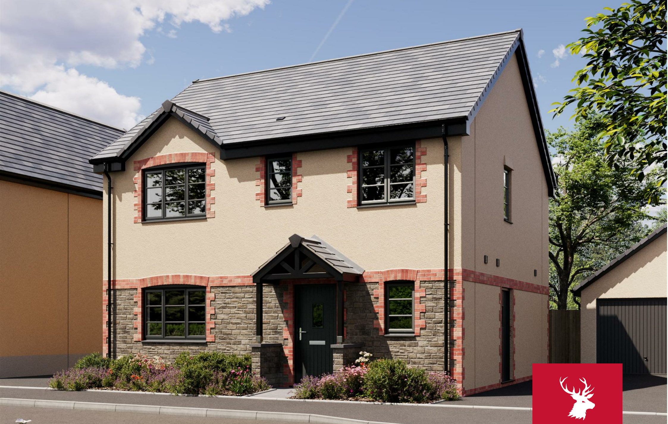
Plot 2 - The Redbourne